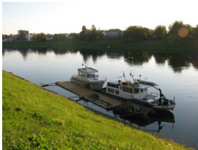
FIG. 13 Sisak – a unique combination of archaeological and architectural heritage