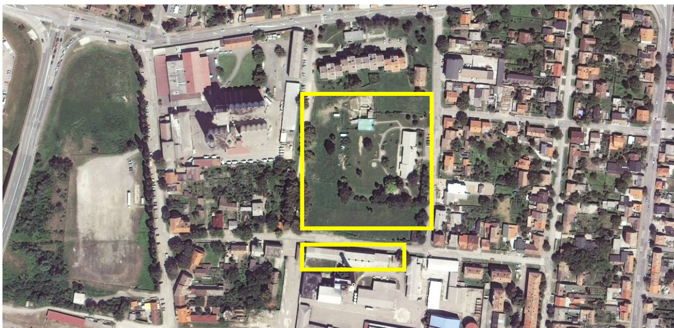
FIG. 5 Park St. Quirinus, the area where the archaeological excavations carried out and the factory "Segestika 1919" d.o.o