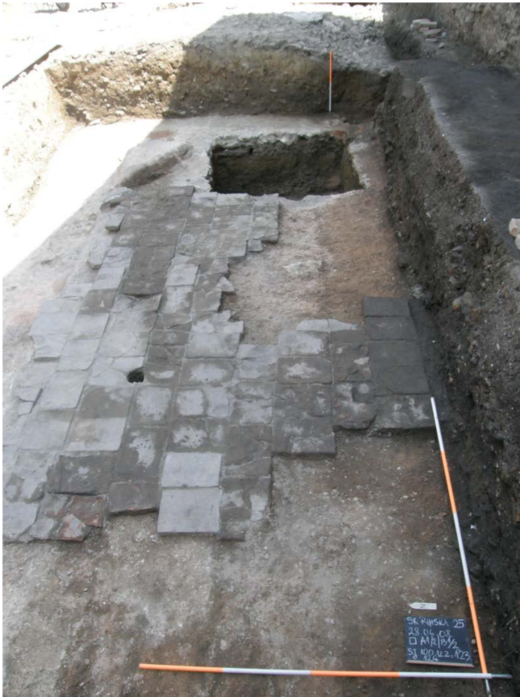
FIG 11 Thermae in the Rimska Street – remains of the roman bathing place