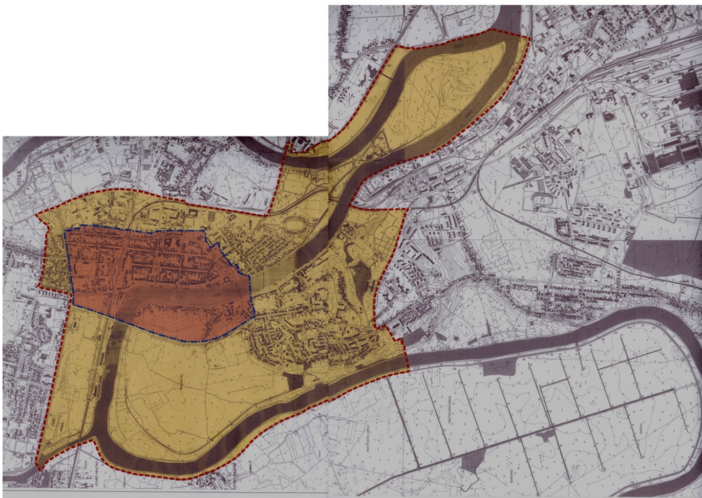
FIG. 3 Archaeological Zone Segestika-Siscia