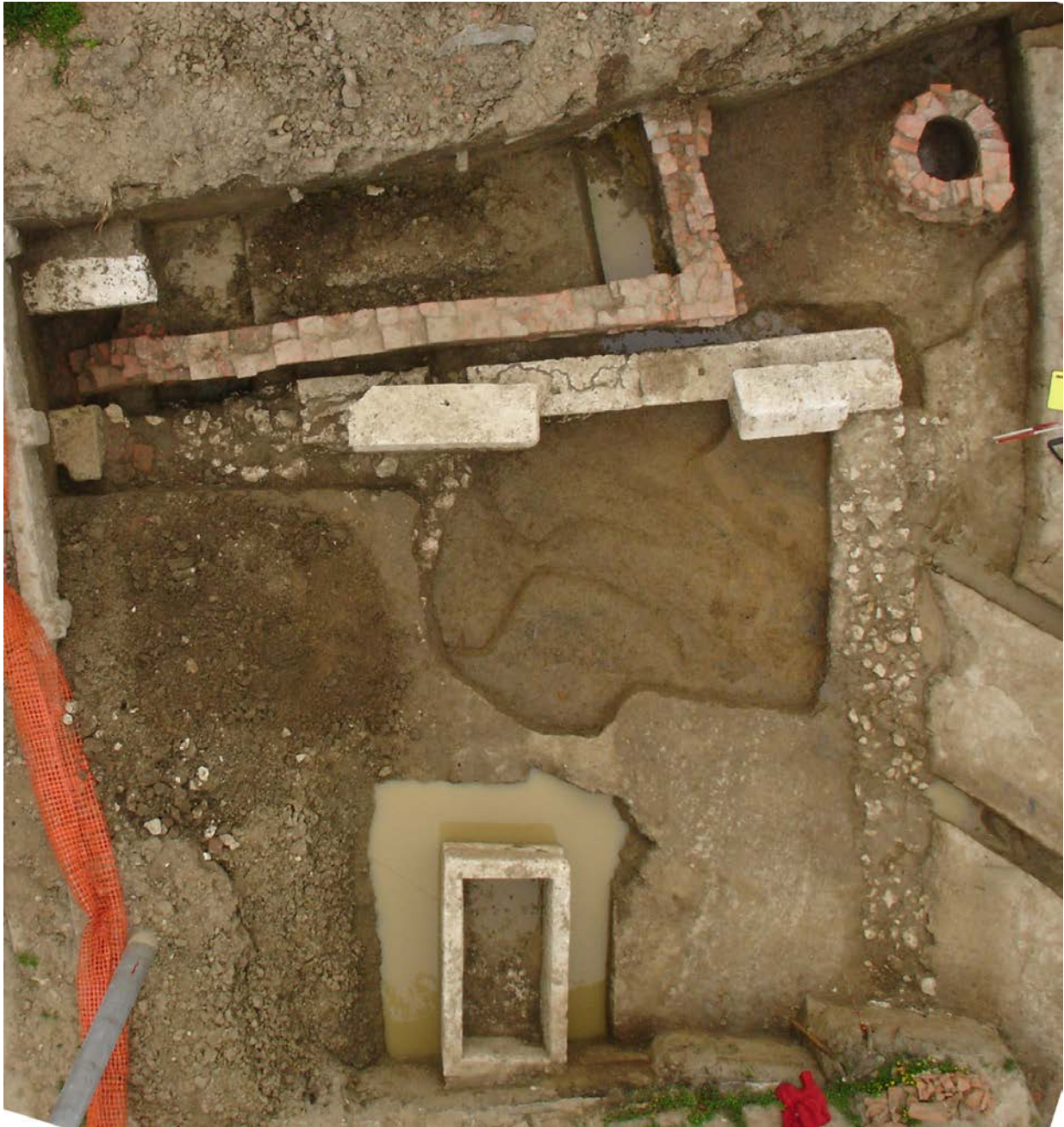
FIG 12 The roman necropolis in Gundulićeva Street