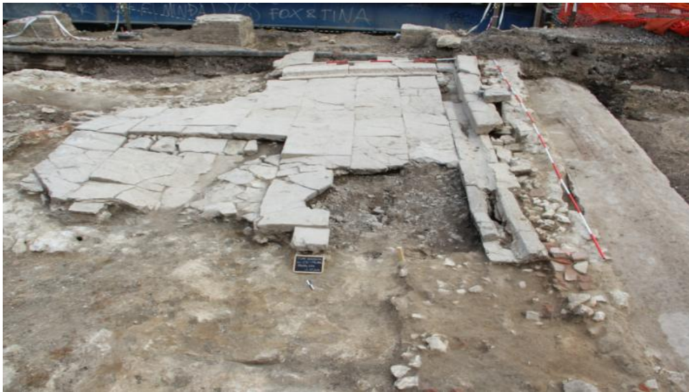
FIG. 10 The finding of the Roman Forum in the construction of underpass at the Railway station in Sisak