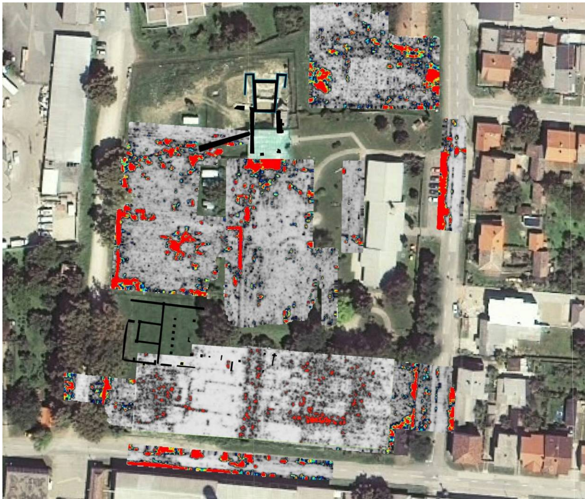
FIG. 6 Results of geophysical studies of the archaeological site of St. Quirinus