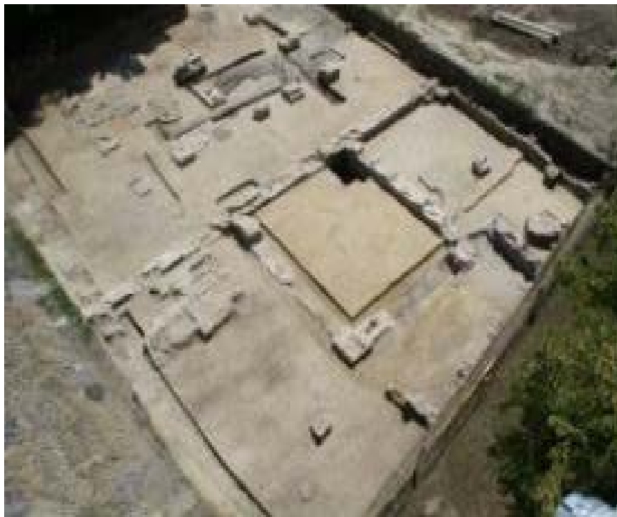
FIG. 8 Results of archaeological excavations the remains of Roman buildings on the site of St. Quirinus