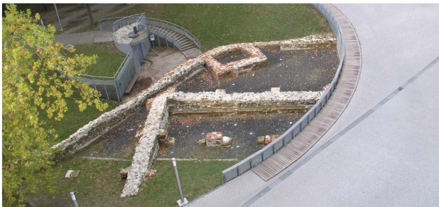
FIG. 9 Siscia in situ archaeological park near the Cathedral of the Holly Cross