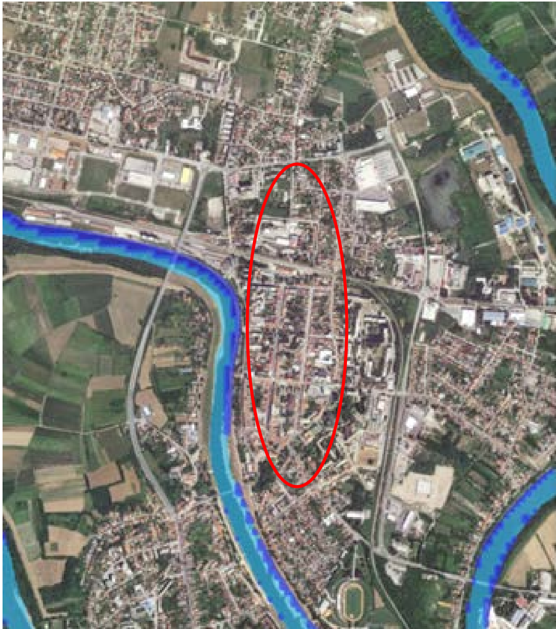
FIG. 4 Position of the Roman city Siscia in narrowest historic zone town Sisak