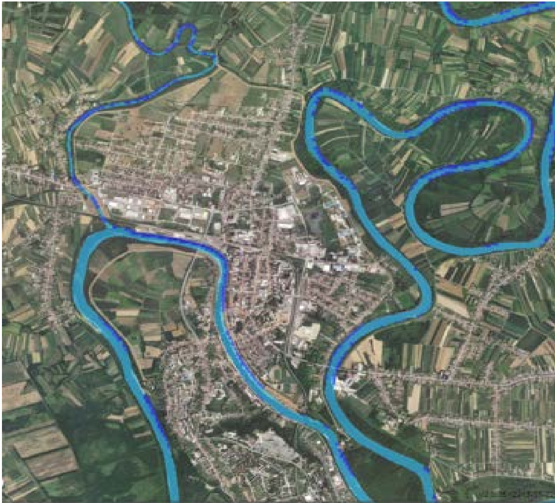
FIG. 2 Place the town of Sisak between three rivers: Kupa, Sava, and Odra